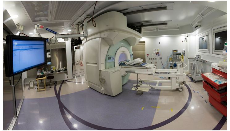
MRgRT Interventional Suite at the Princess Margaret Cancer Centre (Right)