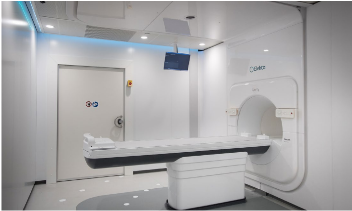
MR-Linac at the Odette Cancer Centre (Left)