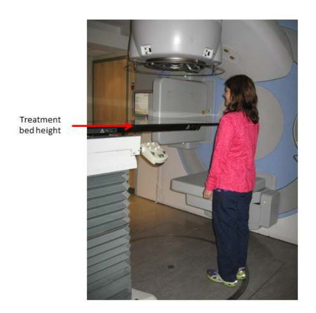
Figure 2: Demonstration of treatment bed height on a standard radiation treatment machine

Post treatment, patients are often tempted to sit upright quickly or jump down from treatment beds, which may increase the possibility of slips and falls. Patients may also fall asleep during treatment, causing them to shift dangerously on the treatment bed. Safety strap usage may therefore prevent falls from dangerous unintentional shifting. In addition, straps, along with other immobilization devices, emphasize the importance of not moving while on the bed, ensuring that patients remain in the correct position for treatment.