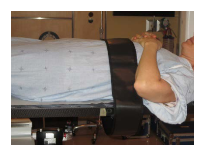
Figure 1: Example of a removable Velcro safety strap used on a patient

Importantly, safety straps recommended for use in this document are not to be confused with restraints, defined as a method to place a person under control by the use of force, mechanical means or chemicals where the person is unable to release it him/herself (Health Quality Ontario, 2013). Safety straps should be placed in positions that are easily removable by the patient if needed. Straps are used to enhance the safety of the treatment environment (during both simulation and treatment procedures) for both patients and providers. Preventing undesired movement while on treatment beds minimizes the risk of movement on treatment beds, acting as an additional safety measure.