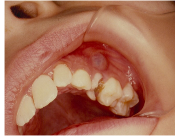
Figure 3: Periodontal abscess