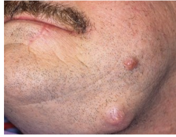
Figure 2: Extra oral infection