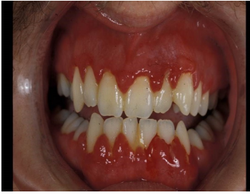
Figure 1: Severe gingivitis