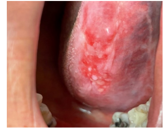
Figure 2: Targeted Therapy Stomatitis