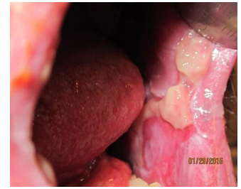
Figure 1: Targeted Therapy